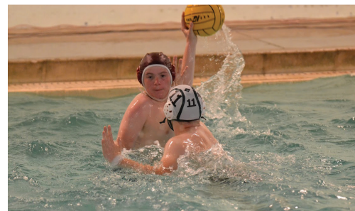
A SKHS Water Polo player ready to pass

The South Kitsap High School Pool Modernization is the largest and most complex project that is detailed in the Capital Project Levy. The needs for the SKHS pool building are extensive to restore the facility to operation. As such this project is a top priority for the execution of the Capital Levy. Following a year of analysis, meetings, investigation, design, and permit review, the competitive public bid process has been completed for the SKHS Pool Modernization Project and the bid award was approved by the SKSD Board of Directors at the January 19, 2022 meeting.