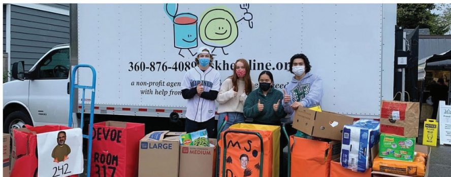
South Kitsap High School ASB leaders delivered an impressive 1,000 pound donation to South Kitsap Helpline following the school food drive.