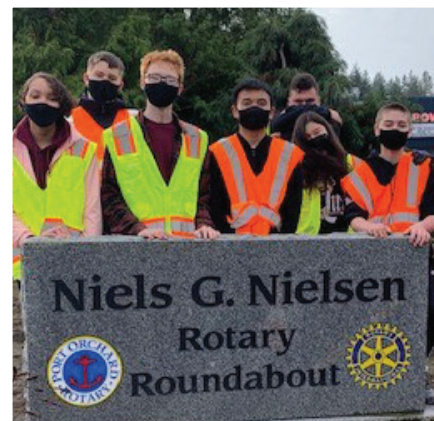
NJROTC cadets volunteered with Rotary members to plant 500 bulbs at the Port Orchard Rotary round about.