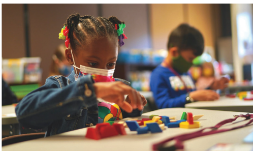
Two Manchester Elementary students learning with blocks

South Kitsap students breathe easier thanks to the dedicated Facilities and Operations team and their care of aging systems. The team updated HVAC systems in schools. Repairs and replacements have been completed throughout the year. Most recently, a 10 ton HVAC unit was replaced at Manchester Elementary in the gymnasium/commons area. Air quality monitors and filtration units have been added in multiple classrooms and office areas throughout the district.